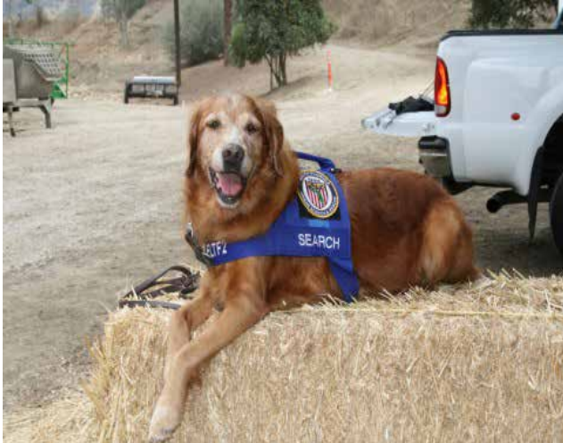
Lilly and her handler