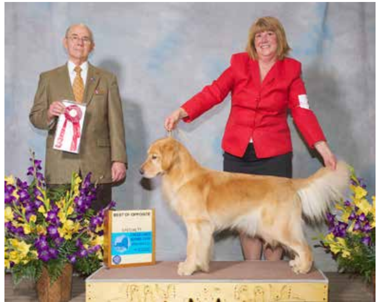
Best of Opposite Sex: CH. Willogold Stars Come Out