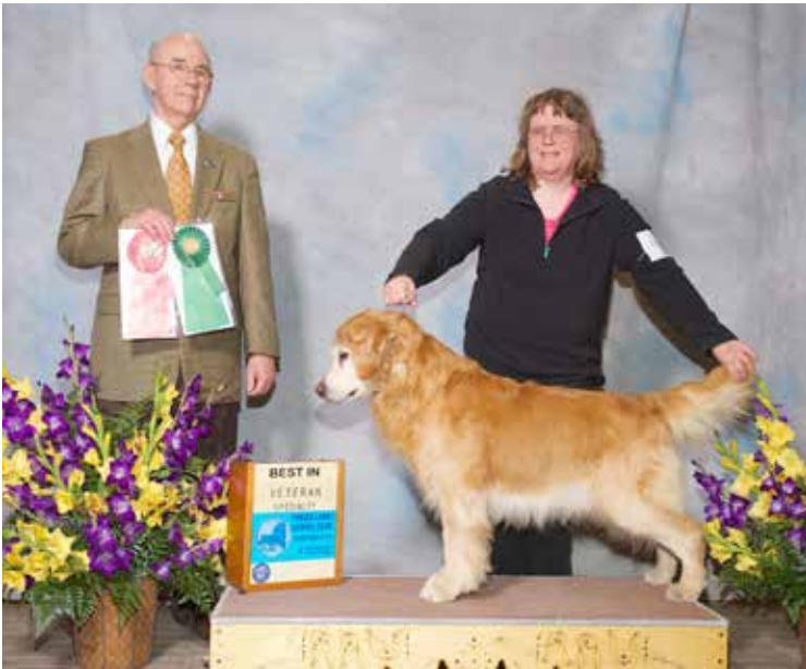
Best Veteran: Ducat's The Road to Northern Lights