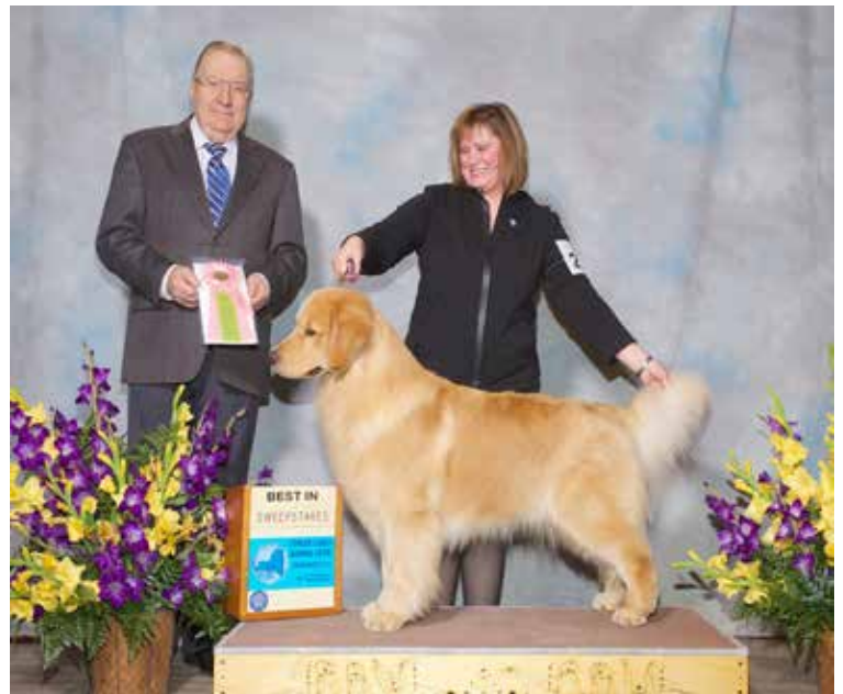
Best in Sweepstakes: Traeloch's Backfield in Motion