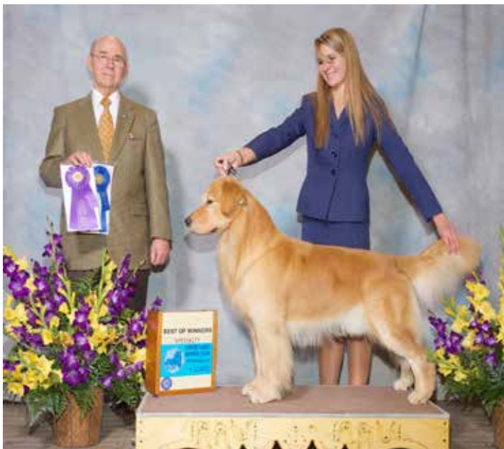
Best of Winners: Golden Joy's Comstock Casablanca, NA, NAJ