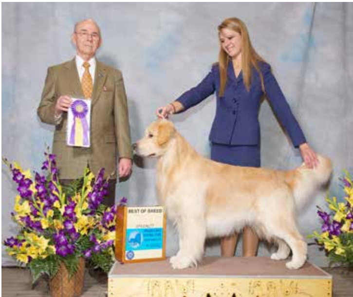
Best of Breed: Mud Lake Mad Hatter Maxx

(Fc Wraiths HTRMBRO Macdhuibh ex Firemark's Prepare For Takeoff, UD, MH)