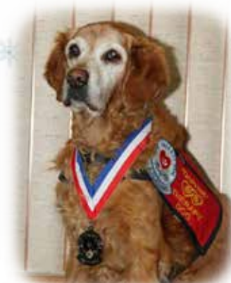
Daphne and her THDX title